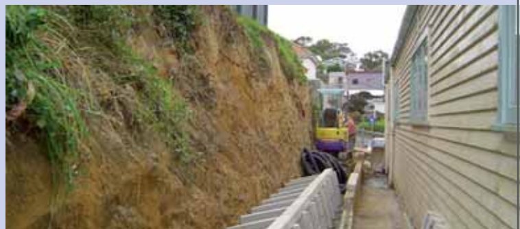
The bank behind St Bernard's, Brooklyn, is strengthened with a new retaining wall