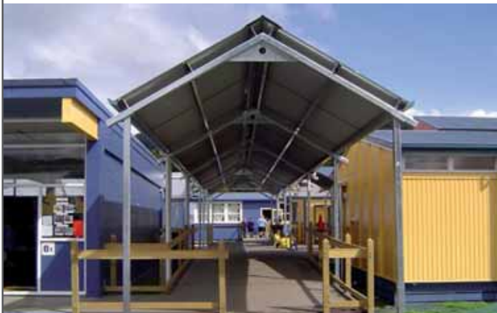
New covered walkways are being built at St Claudine Thevénet in Wainuiomata

In the Property Portfolio section of this issue of Boardtalk we look at insurance matters for individual schools, and what measures schools can take to protect property from risks including earthquake, fire, vandalism and theft. We can all benefit from reading this information.