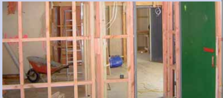
The administration block at St Francis de Sales, Island Bay is undergoing major refurbishment

Architects have been appointed for all the projects on the 2006 and 2007 programme and design work on some of the projects is already well advanced. It is good to see real progress now being made on the Board's priorities to upgrade primary administration and secondary technology blocks.