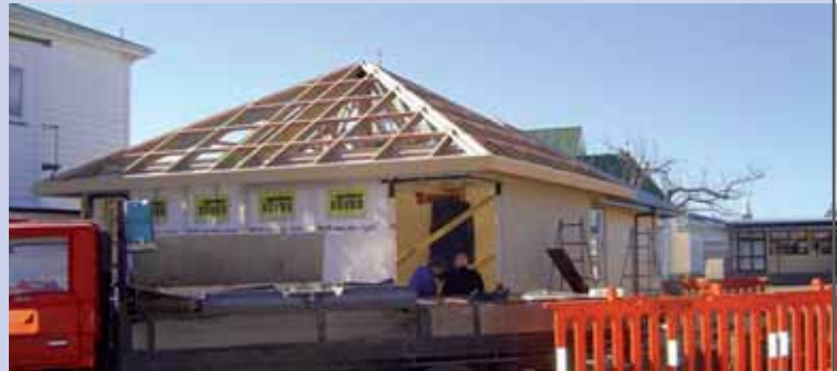
New library under construction at St Joseph's Wairoa