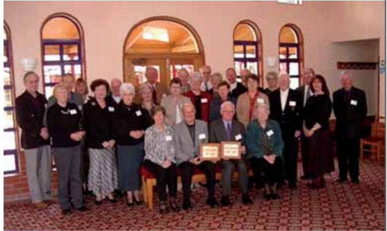
Past and present members of Catholic Schools Board Limited and its predecessor Catholic Education Management Board and guests at the 25th Jubilee