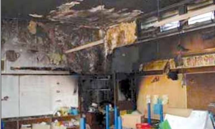
The devastation fire can cause in a school