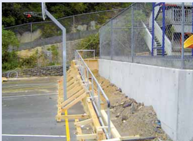
Access ramps under construction at St Benedict's, Khandallah