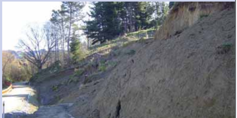
Work has begun on preventing further slips of the playing field at St Joseph's, Taihape

Students and teachers are responsible for the insurance of their personal property while it is at the school or in transit — this is not covered by the school contents policy.