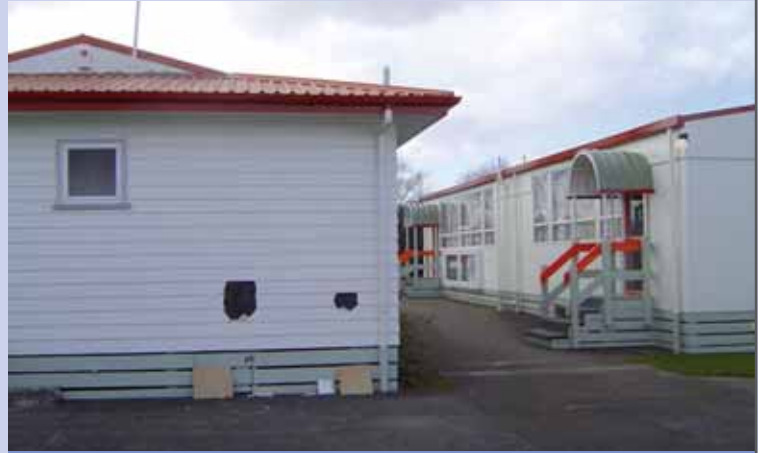
Vandals damaged this wall at one of our schools in an (unsuccessful) attempt to gain access to the building.