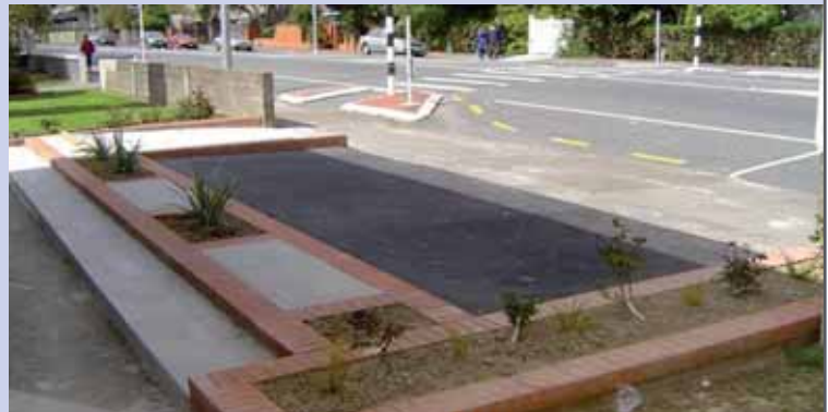
Flood protection to the front entrance of St Bernard's College, Lower Hutt

Sabotage; vandalism; burglary; graffiti; theft; riot and civil commotion.